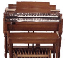
Not Actual Photo

Compac Presario with Windows 95; Computer & Monitor. 336-2744