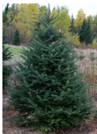
Not Actual Photos