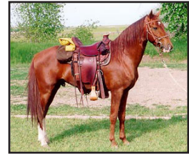
Not Actual Photo

Registered Missouri Foxtrotter, Mare, 8 years old, well mannered, gentle, an easy keeper, lovingly cared for, all shots current, $4,000. 292-2217